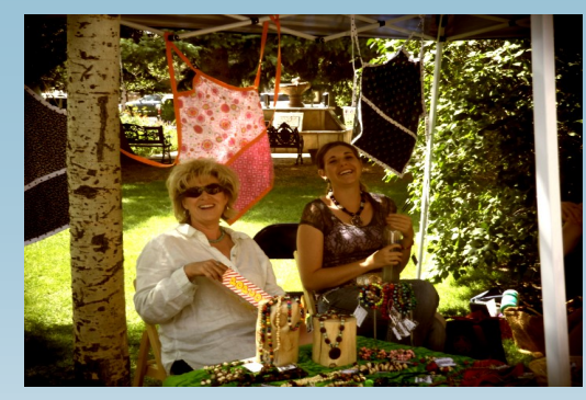
Art Fest on the Ivinson Lawn during Jubilee Days