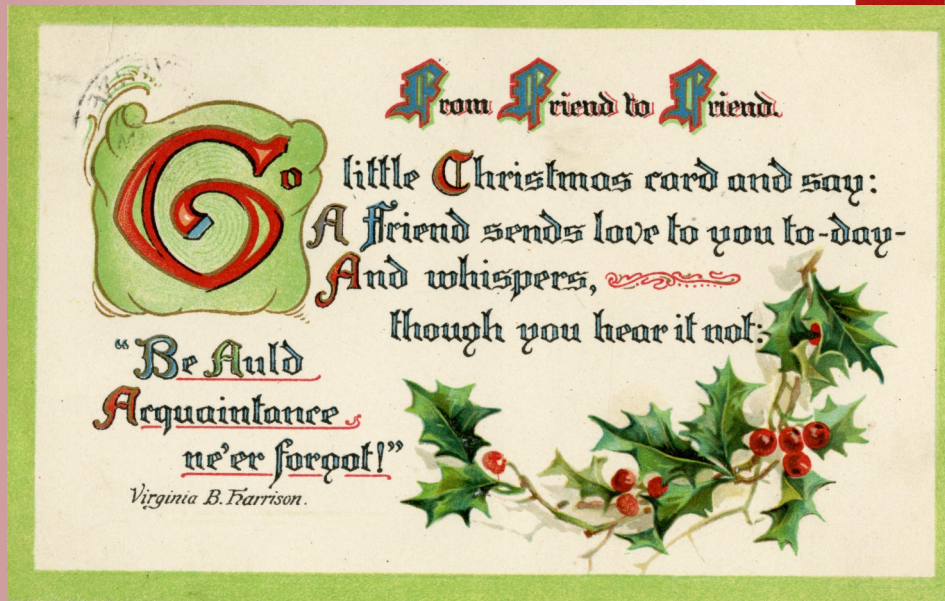
Christmas Poem. Printed in Bavaria, no address remains, stamp has been removed but does have postmark of Cheyenne, Wyo. December 20, 1910. Unknown donor.