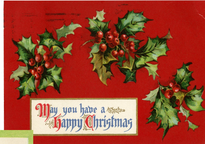
POSTCARD: 1908, Greeting card "May you have a happy Christmas". Color printed and embossed, of holly and berries. Has gold ink. Mailed, one cent Franklin stamp, Postmarked Chicago, Illinois, December 23, 1908. Printed in Bavaria.