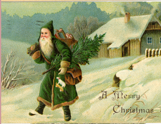
POSTCARD: 1908, greeting "A Merry Christmas" color-printed drawing of green-robed, bearded man carrying a small pine tree and sack of toys on his back, a bundle with a strap on his shoulder in snow scene with house in background. Mailed, one cent Franklin stamp, Beatrice Nebraska, 1908. "Made in Germany" printed on back.