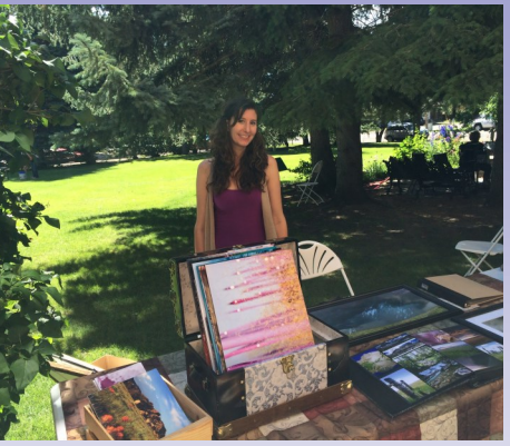
Art Fest on the Ivinson Lawn during Jubilee Days