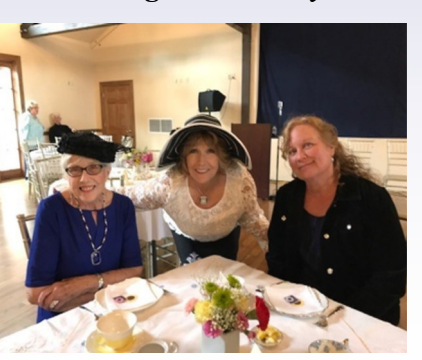
Tea on Tuesdays