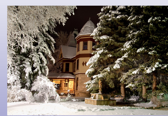
Holiday Open House