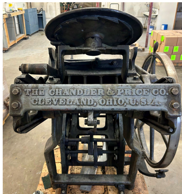
Chandler and Price Printing Press, 2022.

The commercial printing department of the Laramie Republican was called the "Republican Job Office," which is the name used in its published books, pamphlets,