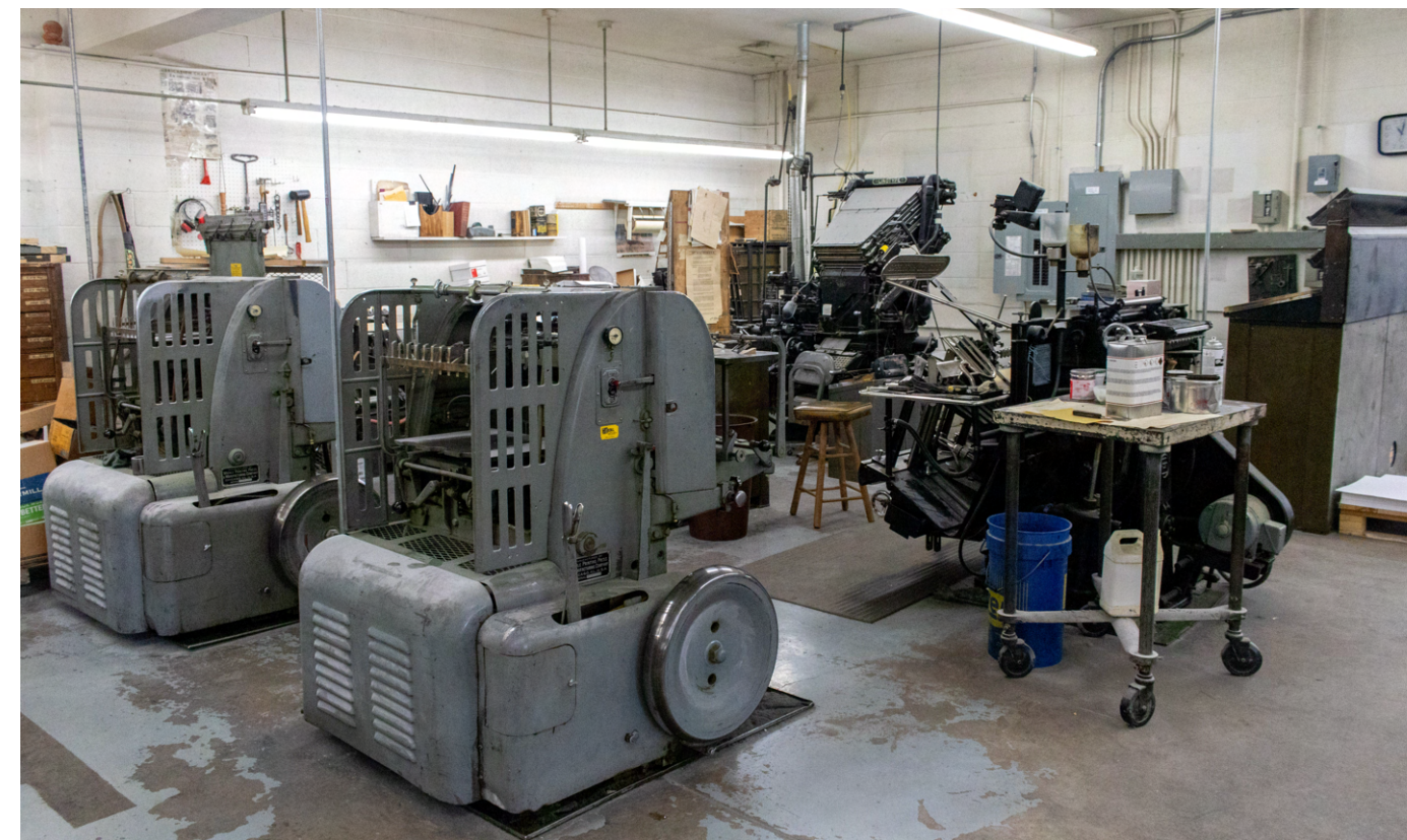
Modern Printing Workshop, 2022.

During the night of April 14, 1948, Mountain States was one of the casualties of the Holliday Fire. All equipment and office records were destroyed. Two days later, the Mountain States reopened in the office space of Western Public Service; the Laramie