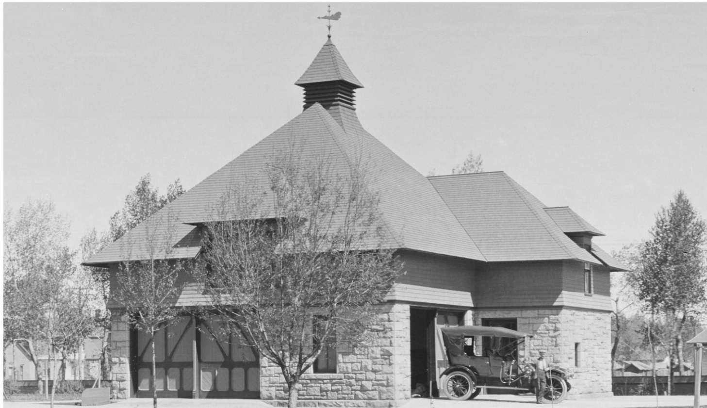
Carriage House, taken by Svenson Photography, 1911. Credit: American Heritage Center.