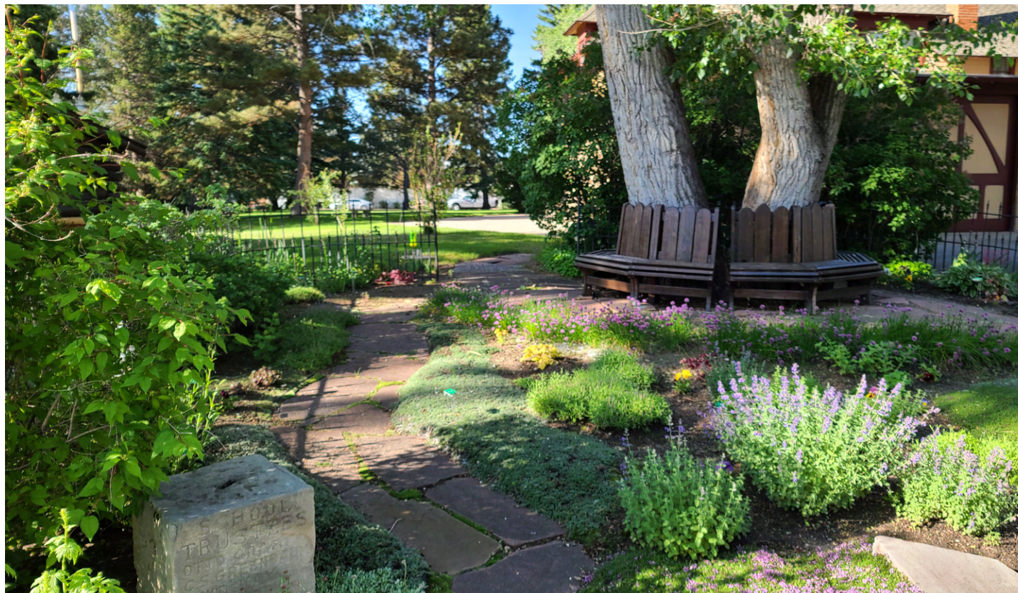
View of the Secret Garden, facing south.